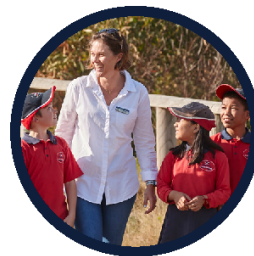
Build skills through fun