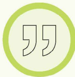
Conventions of language (spelling, grammar and punctuation)